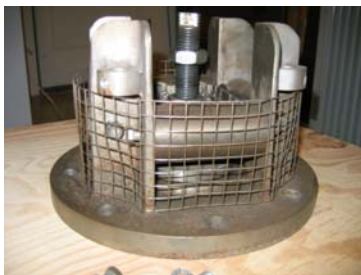
Side View – As Received Dome Cover Removed

Shown here are pictures of the valve and spring package in the as-received condition. There was minor surface dirt present but there was no indication of abnormal component wear or physical spring degradation. The springs were subjected to factory tension testing in the as-received condition and the readings showed values were within the design limits of new springs.