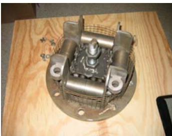
Top View – As Received